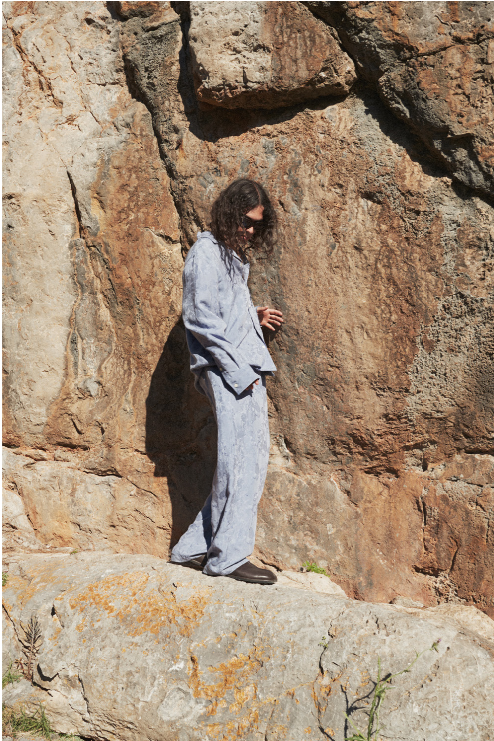
Zivro Nomad Pants 202013-6763