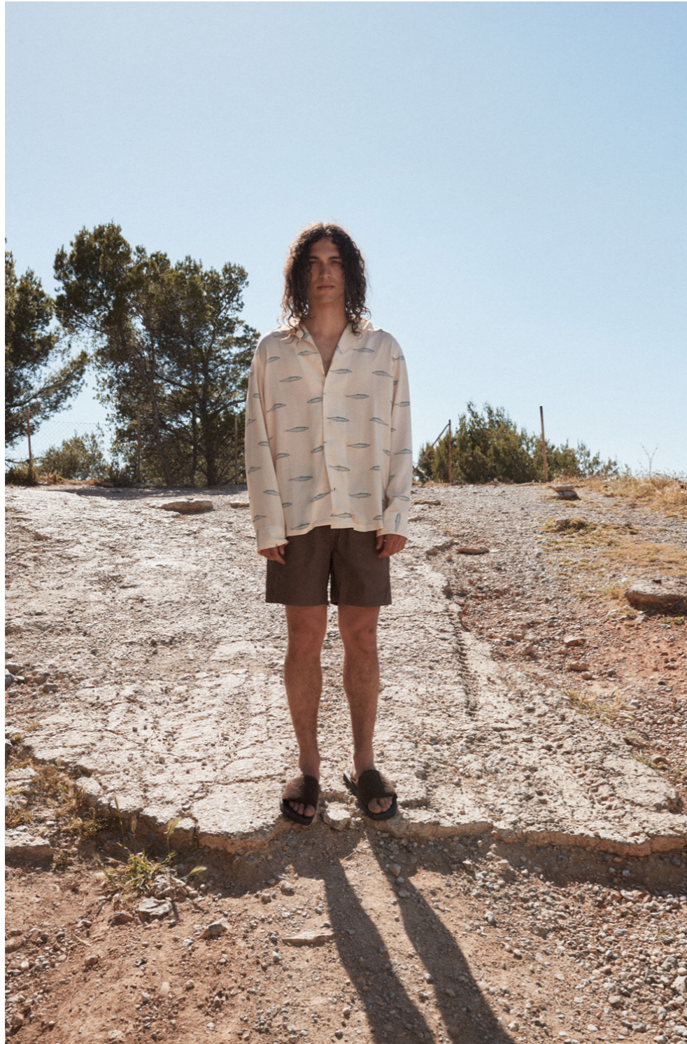
los Swim Shorts 201009-1615