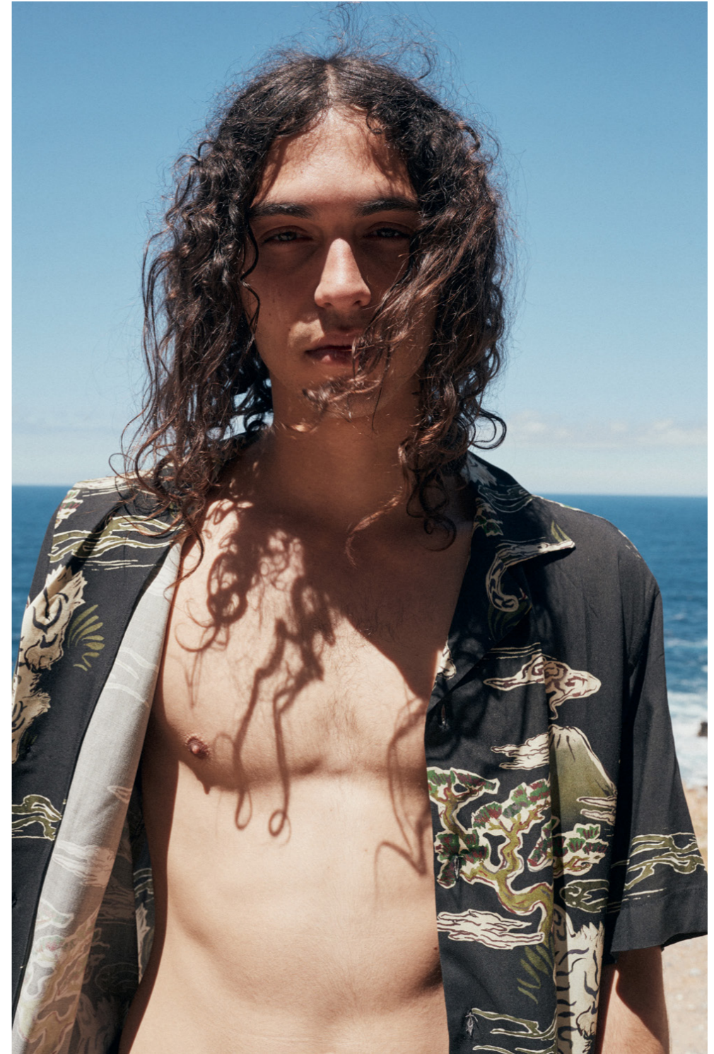
Mahalu Paros Swim Shorts 201018-1619