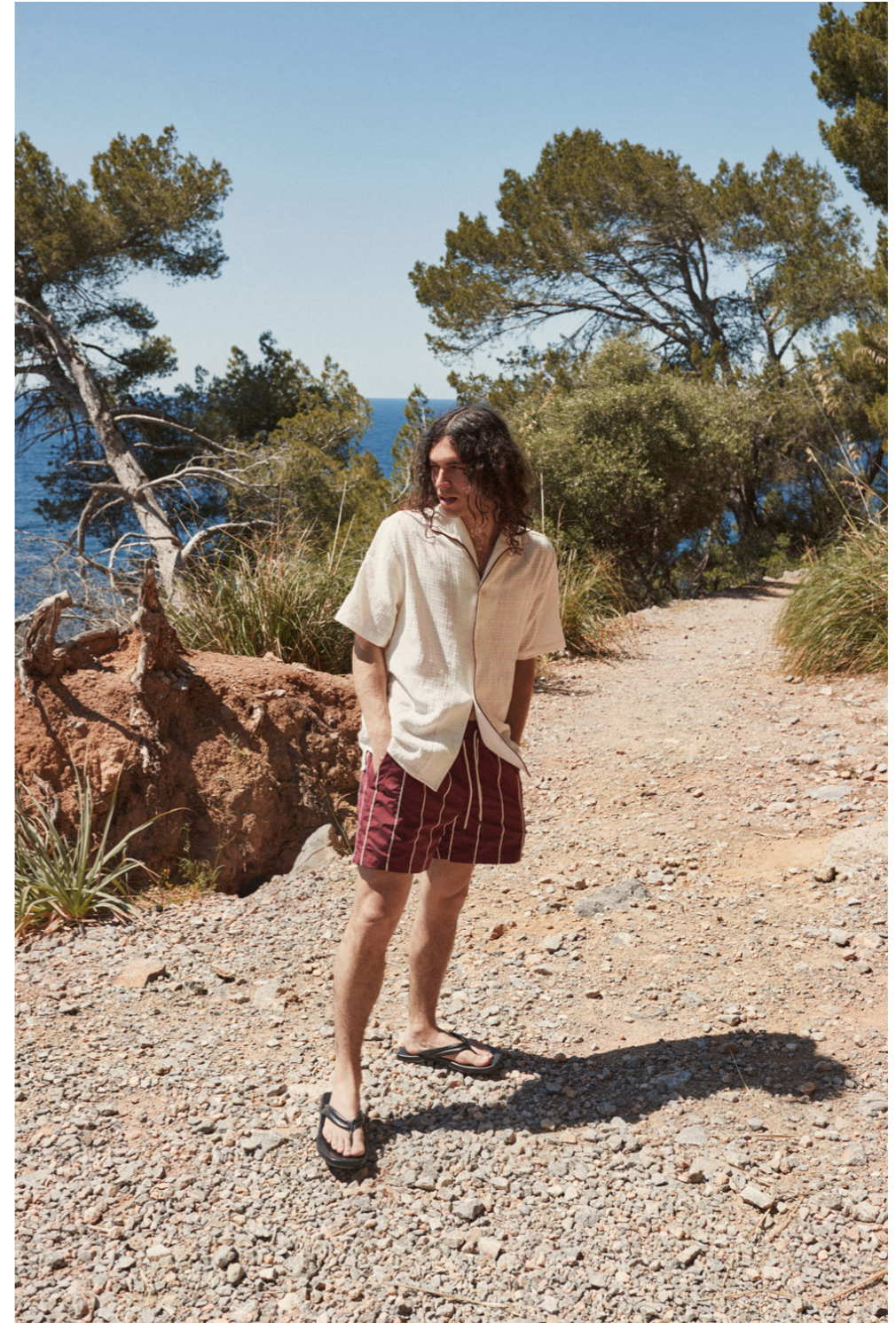
Feri Costa Swim Shorts 201001-1625