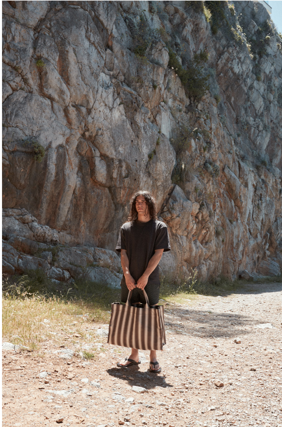
Kurai Rocco Shirt 101002-4544