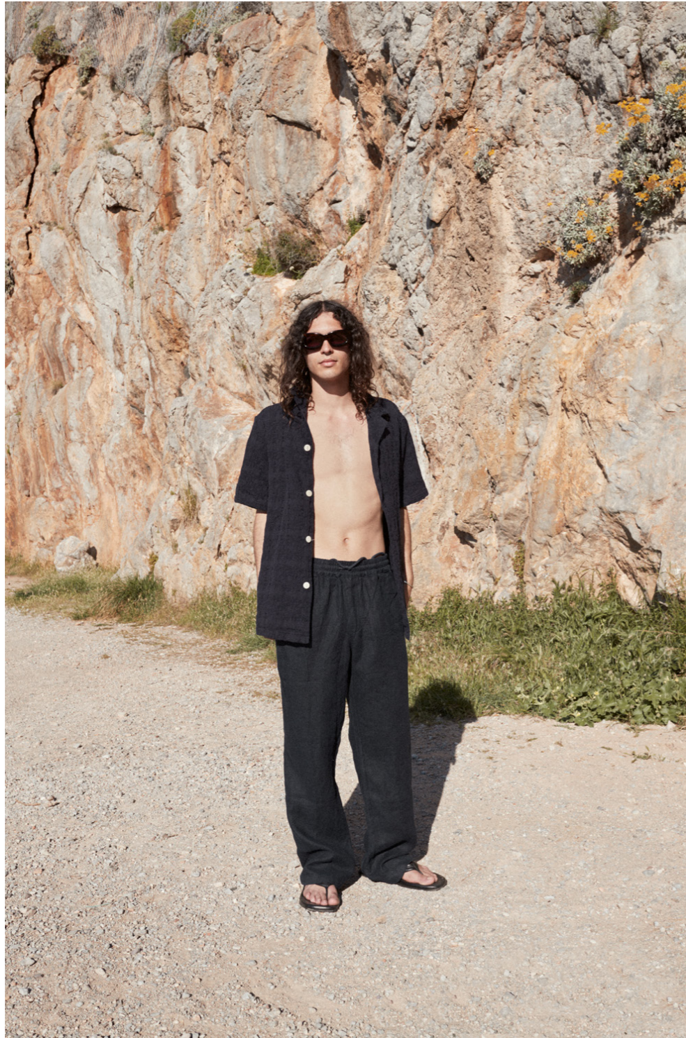
Nino Pants 202009-1003 Olbia Flip Flop 703007-1976