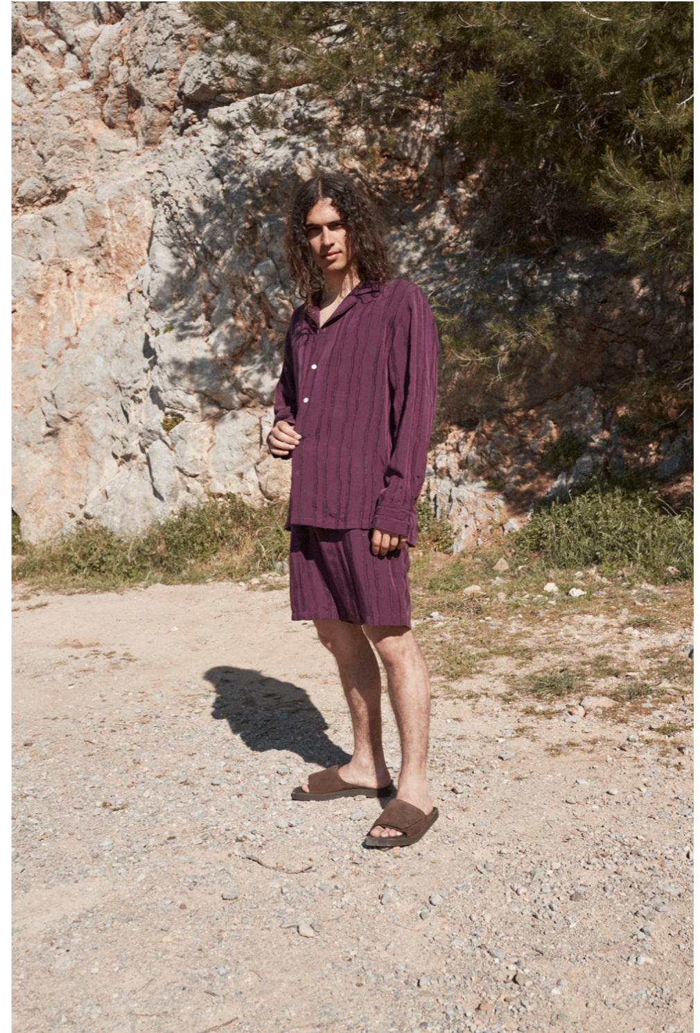
Nivlo Corfu Shorts 201016-6762