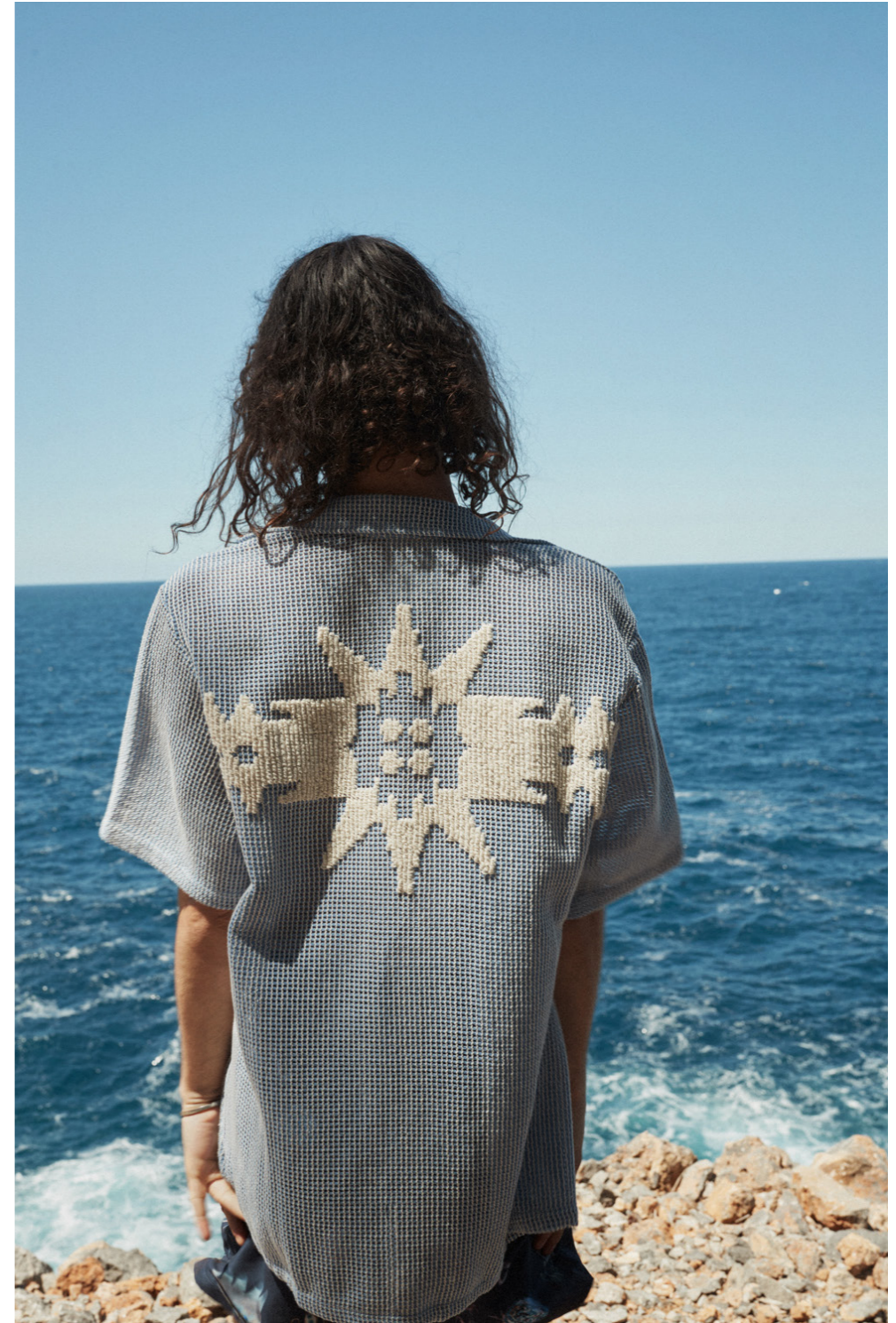
Bloomsea Costa Swim Shorts 201001-1559